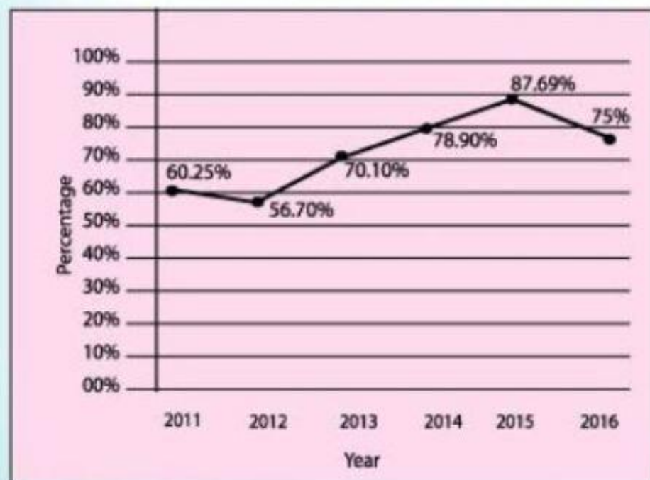
Percentage of Students Passed in Final Professional Examination in Last Five Year